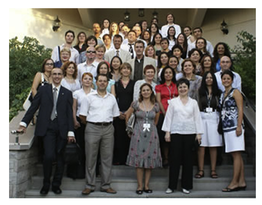
Figure 2 Ankara workshop photo.