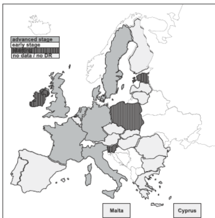
Map 1 – Development stage of digital repositories for research output per EU country as estimated in January 2007.

As of 2007, however, based on a survey conducted by the DRIVER (the Digital Repositories Infrastructure Vision for European Research), it was estimated that "there are approximately 230 institutes with one or more digital repositories with research output in the European Union" (Van der Graaf & Van Eijndhoven, 2007). Only about half of them participated in the DRIVER survey. Several (10) EU countries did not have any IRs listed in OpenDoar then. Map 1 below shows that there is a lot to be desired in terms of the development of IRs in Europe: the number of EU countries in the advanced stage is not that many (the UK, France, Italy, The Netherlands, Germany, Denmark, and Sweden). The EUA's recommendation may play a crucial role and generate further interest in OA and IRs in European universities, thereby increasing the total number of IRs and change the European repository landscape might change tremendously in the near future.